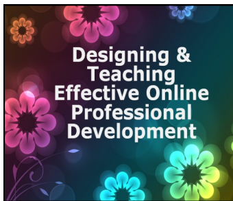
Designing & Teaching Effective Online Professional Development Slideshow Presentation

This session will guide participants in developing and teaching online professional development courses. The participant will be lead through the steps of course development, online teaching, and online assessment. The session will emphasize principals of course design which are outcome-based, performance-based, and collaborative.